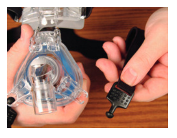
Disconnect one side of the headgear by releasing one ball-and-socket Quick Clip from the faceplate socket.