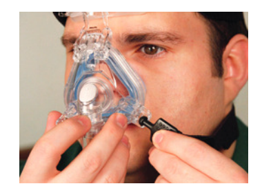
Attach the Quick Clip on the disconnected side. For easy attachment of the Quick Clip, use the index finger as a guide to find the position of the socket and press the clip into the socket.